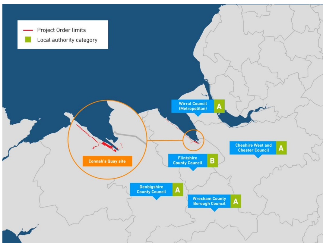
Figure 3: Administrative boundaries of section 42(1)(b) authorities for DCO Application