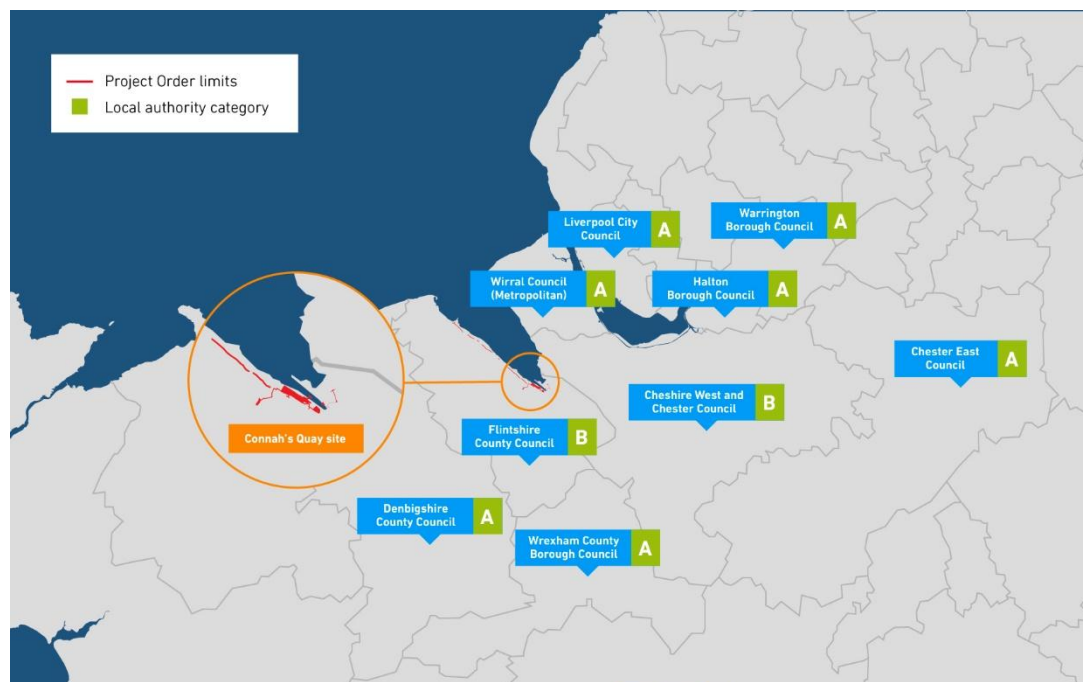
Figure 2: Administrative boundaries of section 42(1)(b) authorities for Statutory Consultation